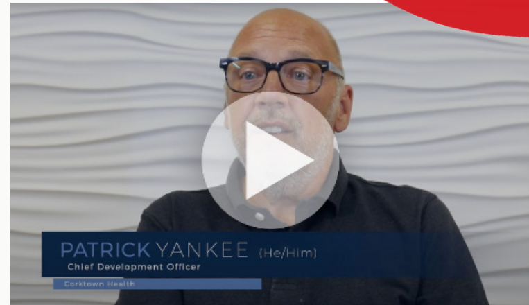
Corktown Health - LGBTQ+ Affirming Health Care Blue Cross Blue Shield of Michigan