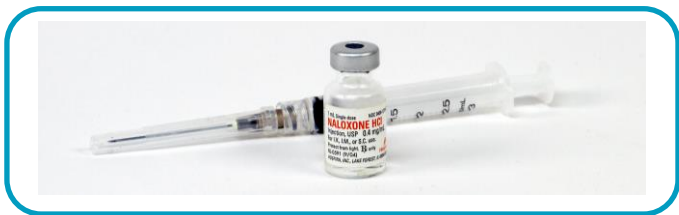
Figure 3. Intramuscular kit Used with permission. San Francisco Department of Public Health. Naloxone for opioid safety: a provider's guide to prescribing naloxone to patients who use opioids . January 2015.

IM kits should contain: 2 naloxone 0.4 mg/ml vials, 2 IM syringes, step-by-step instructions for responding to an opioid overdose, and directions for naloxone administration.