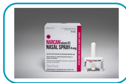
Figure 1. IN nasal spray

IN nasal spray: commercially available as a twin pack with directions for administration included.