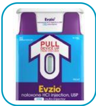
Figure 4. IM auto-injector

IM auto-injector: commercially available as a twin pack with directions for administration included.