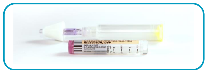
Figure 2. Intranasal kit Used with permission. San Francisco Department of Public Health. Naloxone for opioid safety: a provider's guide to prescribing naloxone to patients who use opioids. January 2015.

IN kits should contain: 2 naloxone 2 mg/2 ml prefilled syringes, 2 atomizers, step-by-step instructions for responding to an opioid overdose, and directions for naloxone administration.